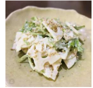
Yuzu Chili pepper Sesame : Lotus roots salad