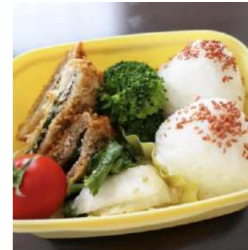
Ume Sesame : Bento lunch box