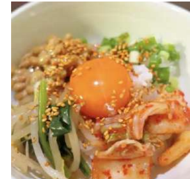
Kimchi Sesame : Bibimbap