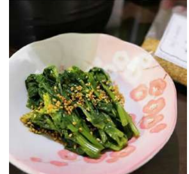
Yuzu Sesame : Boiled vegetables