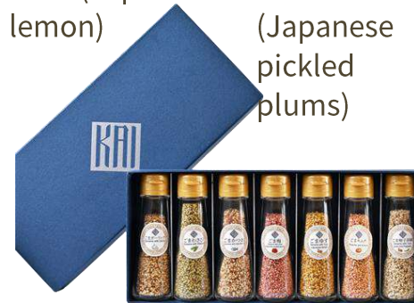
Bottle Gift set of 7 different flavors