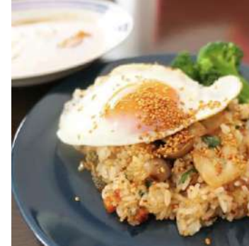
Kimchi Sesame : Kimchi fried rice