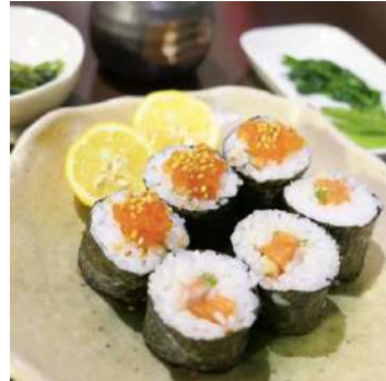
Yuzu Sesame : Rolled sushi with salmon roe and soy-marinated salmon