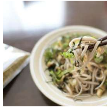
Wasabi Sesame : Soba noodle with Japanese radish

Just sprinkle on the top. Have sesame daily more easily !