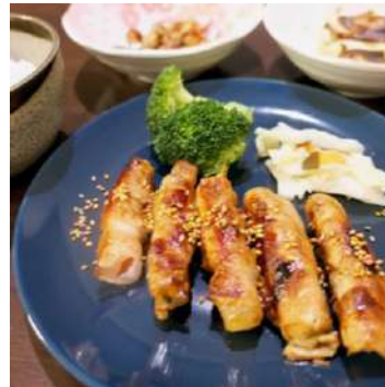
Yuzu Ume Wasabi Sesame : Pork