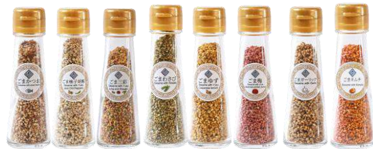
Bottle packaging in 8 flavors