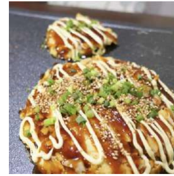
Bonito Sesame : Okonomiyaki